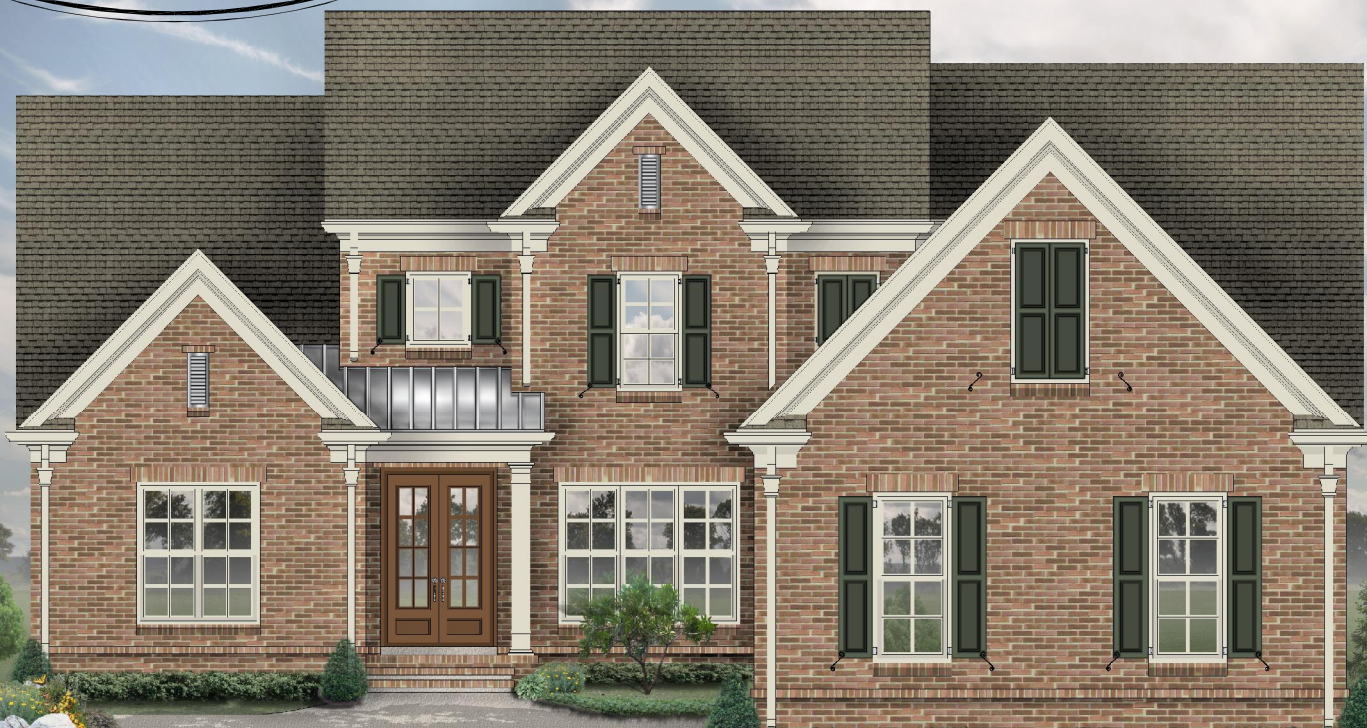
Photo or Rendering May Reflect Changes Made in Field.

9'-0" CEILINGS DOWN 9'-0" CEILINGS UP EXCEPT WHERE NOTED OTHERWISE ON PLAN