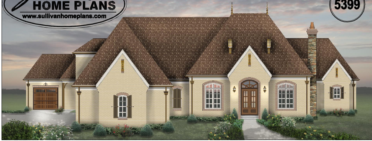
Photo or Rendering May Reflect Changes Made in Field.