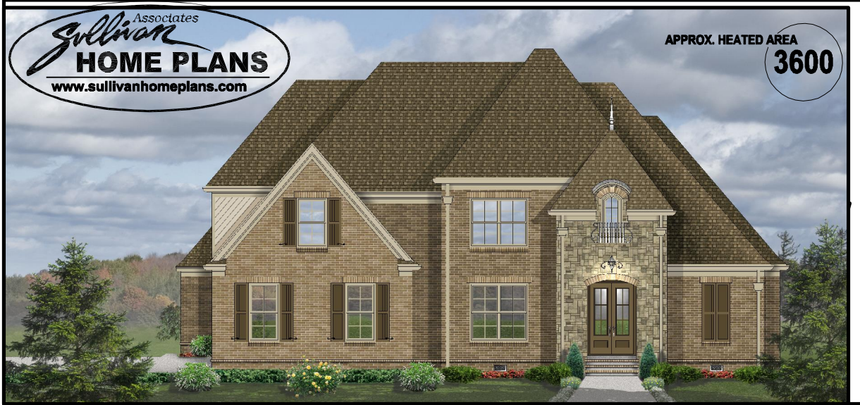
Photo or Rendering May Reflect Changes Made in Field.