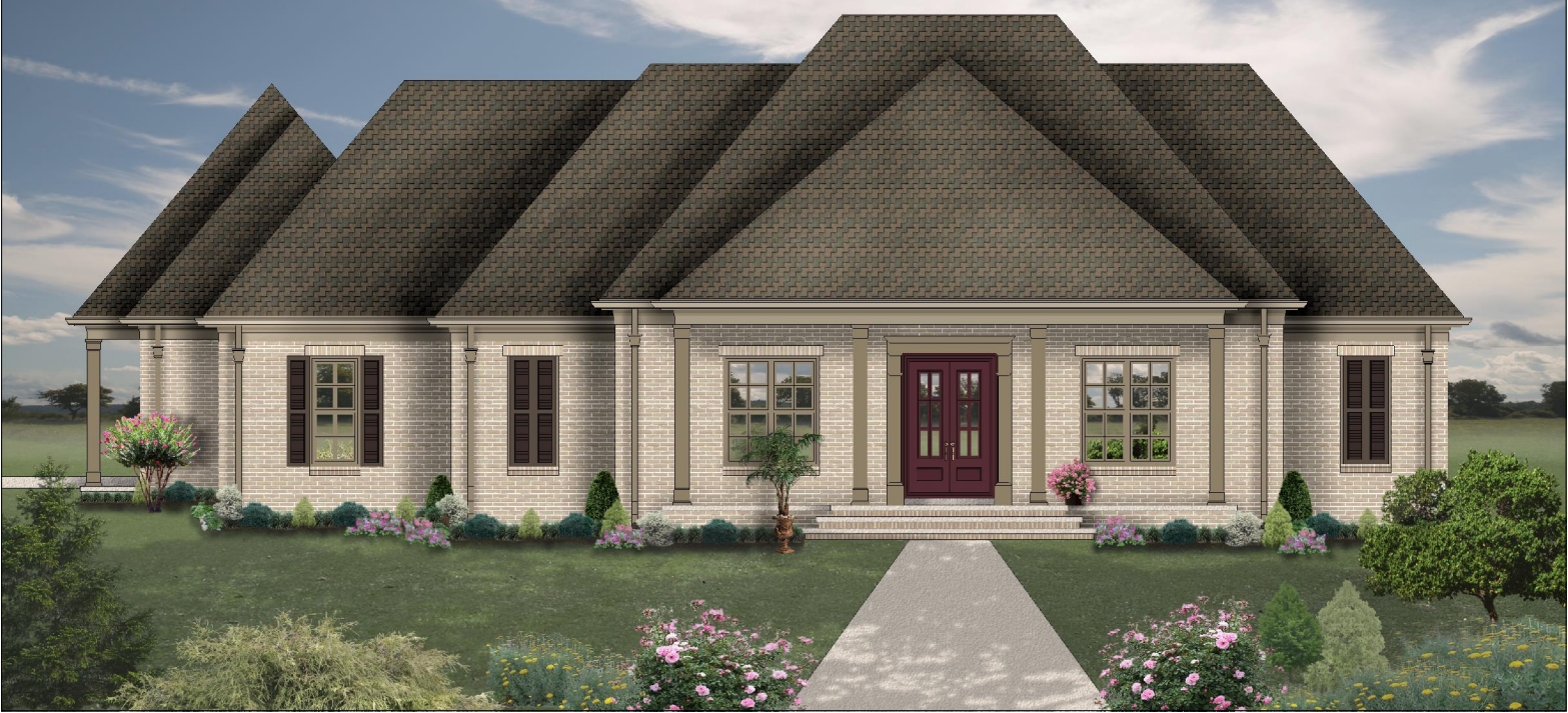
Photo or Rendering May Reflect Changes Made in Field.