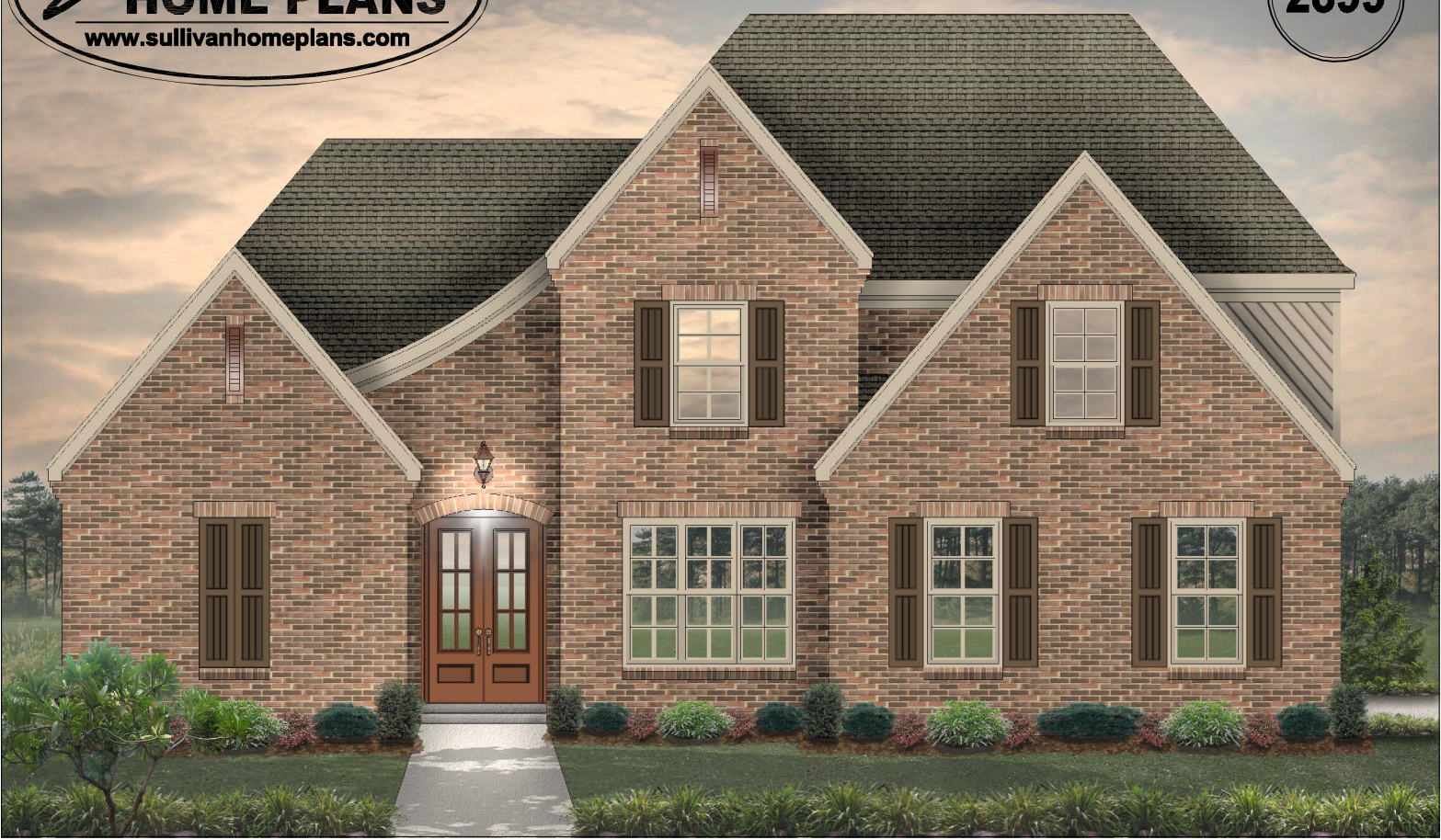
Photo or Rendering May Reflect Changes Made in Field.

9'-0" CEILINGS DOWN 8'-0" CEILINGS UP EXCEPT WHERE NOTED OTHERWISE ON PLAN