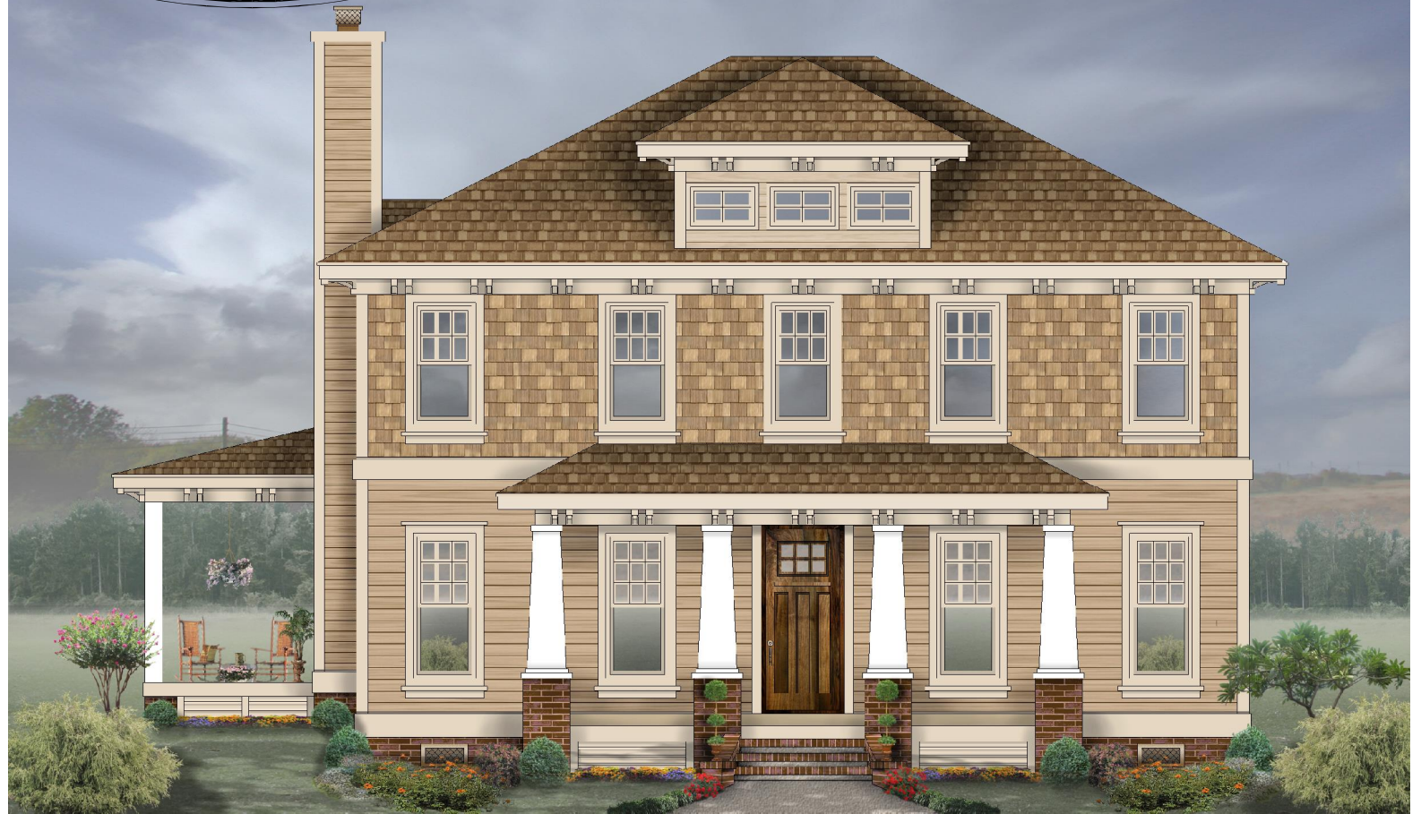
Photo or Rendering May Reflect Changes Made in Field.