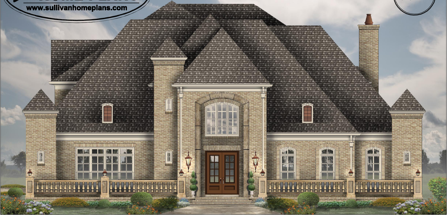
Photo or Rendering May Reflect Changes Made in Field.