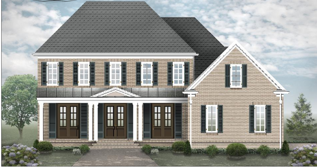
Photo or Rendering May Reflect Changes Made in Field.