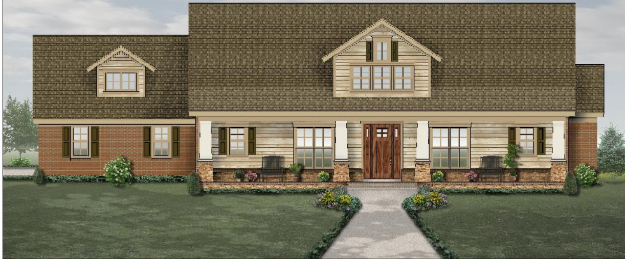
Photo or Rendering May Reflect Changes Made in Field.